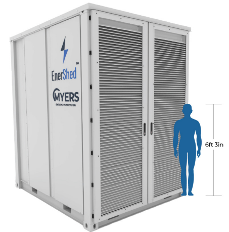
EnerShed LG - Height: 136" Human Scale - Height: 75"