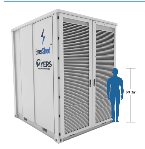
EnerShed LG - Height: 135" Human Scale - Height: 75"